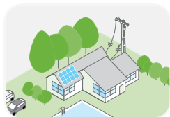
Residential grid-tie solar with backup power